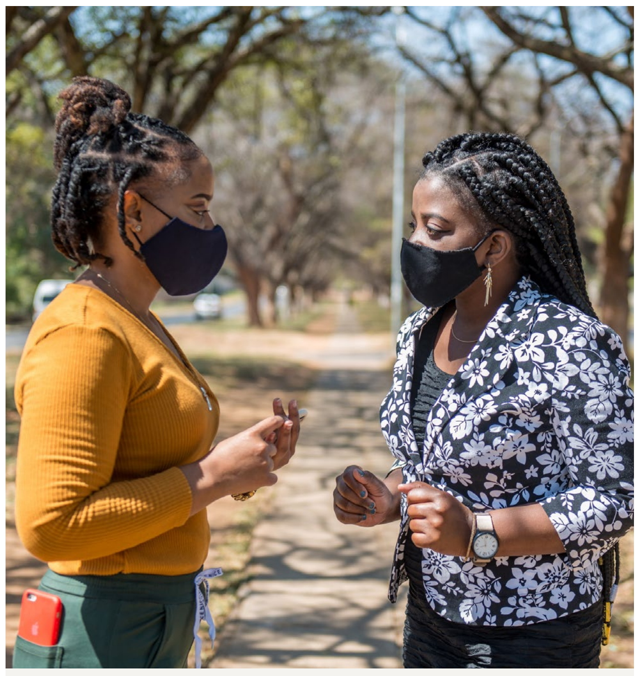
Peer-to-peer counselling